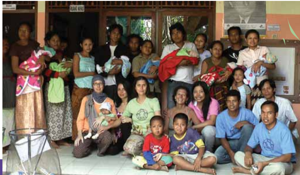
Families gathered at Bumi Sehat birthing center