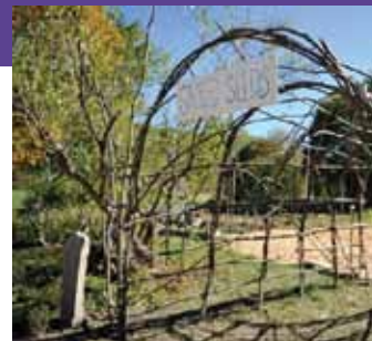
Sacred Seeds at Kindle Farm School in Vermont