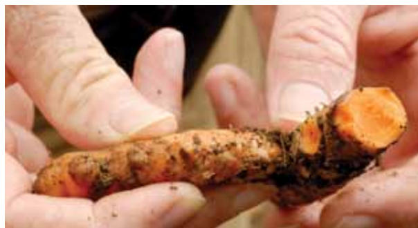
Turmeric, whole food organically grown in Costa Rica

Throughout our supply chain, from Vermont to India, it is our intention to engage partners whose workers are treated with respect and provided with working conditions that are safe, healthy, and balanced. Compensation is critical for sustainability, and we work to ensure that members of our supply chain are paid in a manner that assures that they can provide the basic necessities for themselves and their families. Additionally, we promote equal rights, access to suitable housing, food, education, and health care, as well as freedom of expression, movement, association, and sufficient time for rest and leisure.