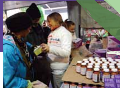
Nourish America distributing donations in New York