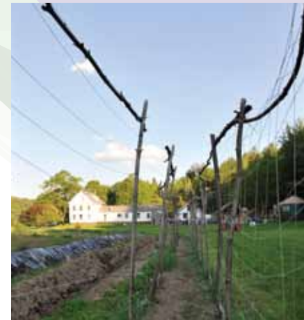
Kindle Farm School Townshend, Vermont

As a business, we work every day to make sure we are treading as lightly as possible on this planet we all share.