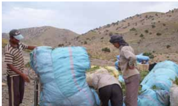
Collecting rosemary deep in the mountains of Morocco

Raw materials are sourced in a way that ensures the ability of future generations to benefit from the bounty of these natural resources. Protection is also given to the local people for use of their own native assets. Favor is given to organically grown or wild-crafted materials.