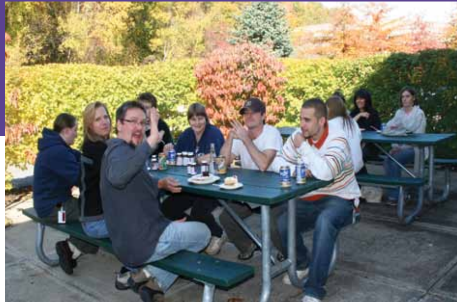
Employees enjoying their lunch in the fresh Vermont air