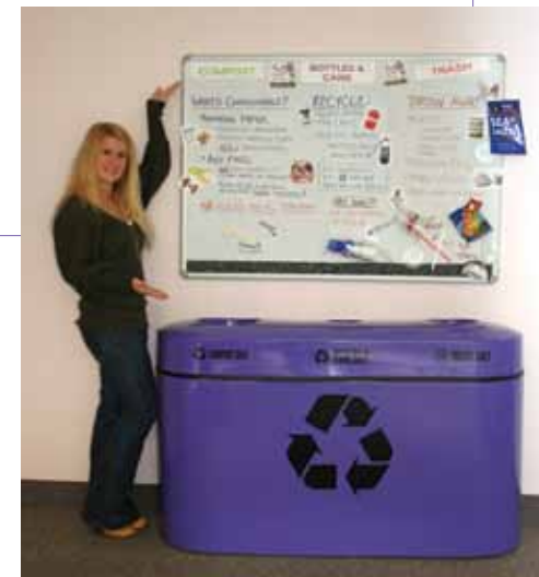
A creative example of one of New Chapter's compost and recycling stations

As we expand our environmental efforts across the globe, we continue to concentrate on our actions at our home base in Vermont with equal commitment. Our initiatives, both large and small, represent our holistic view of planetary healing. Every light bulb and organic meal is as important to us as our recycled packaging and carbon footprint. Regular assessment and monitoring assure we continue to stay aware and responsive to concerns, and are dedicated to making changes that benefit the planet. There are still important strides to make, and we offer in full transparency our trials, tribulations and triumphs.