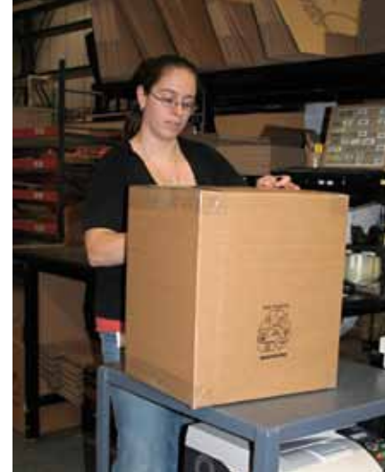
Closing the loop in our supply chain

“Our goal is not only to make products that heal, but to ensure that working at New Chapter also heals. We hope to inspire our employees to begin a new chapter in health in their lives and we aim to create a working environment that supports both happiness and productivity. We count our success by how many smiles we see each day.”