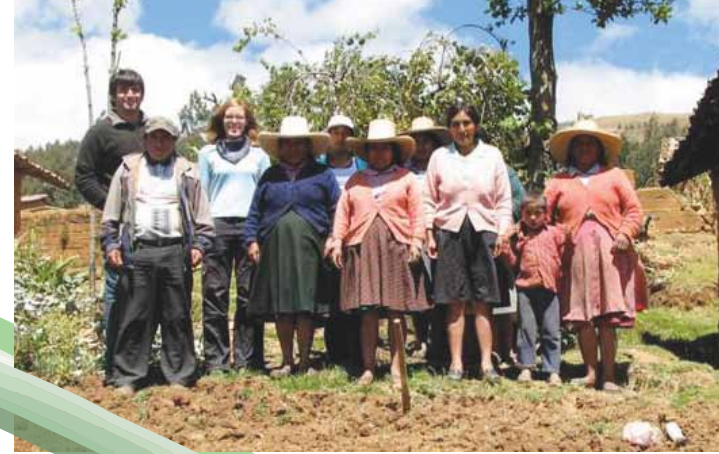
Sacred Seeds, Huamachuco, Peru