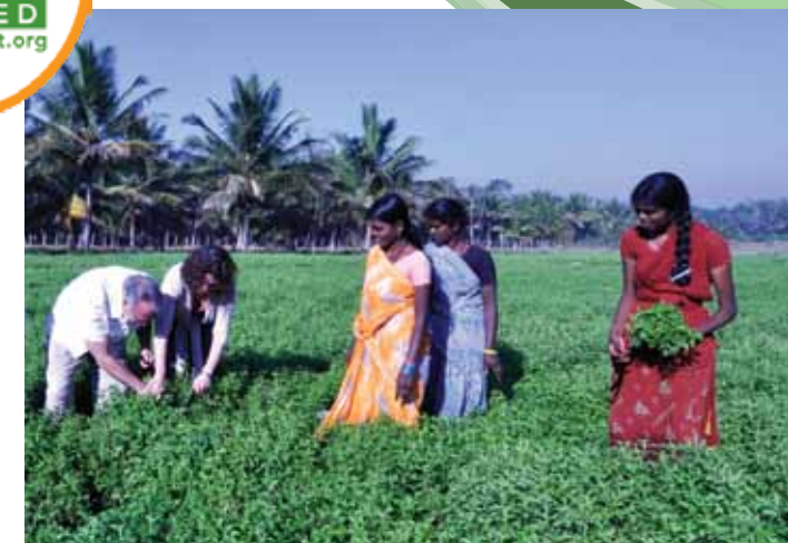
Helping to harvest on organic tulsi farms in India

We are pleased to announce that our multivitamins are the first in the nation to achieve Non-GMO Project Verification. We have long been committed to rooting out Genetically Modified Organisms (GMOs), and are now demonstrating that commitment by pursuing Non-GMO Project verification for our entire line of whole-food vitamins, minerals, and herbs.